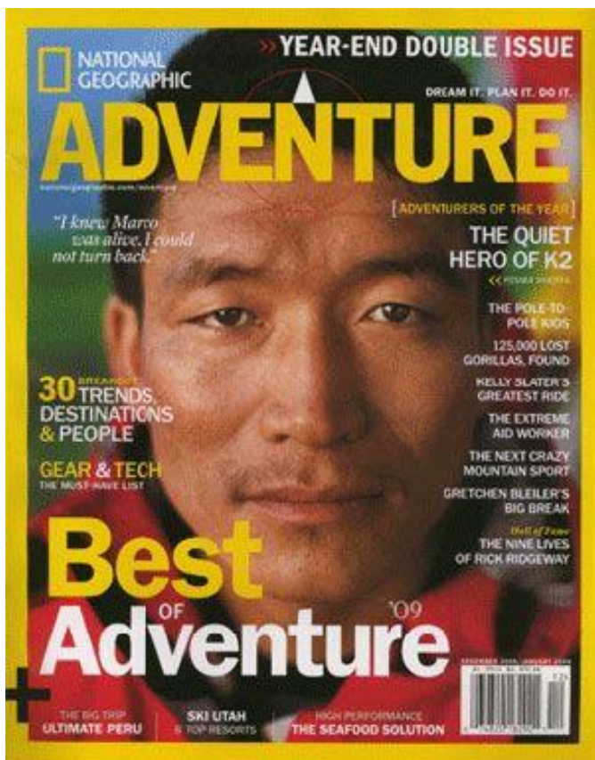
National Geographic Adventurer of the Year - Dec 2008 Jan 2009