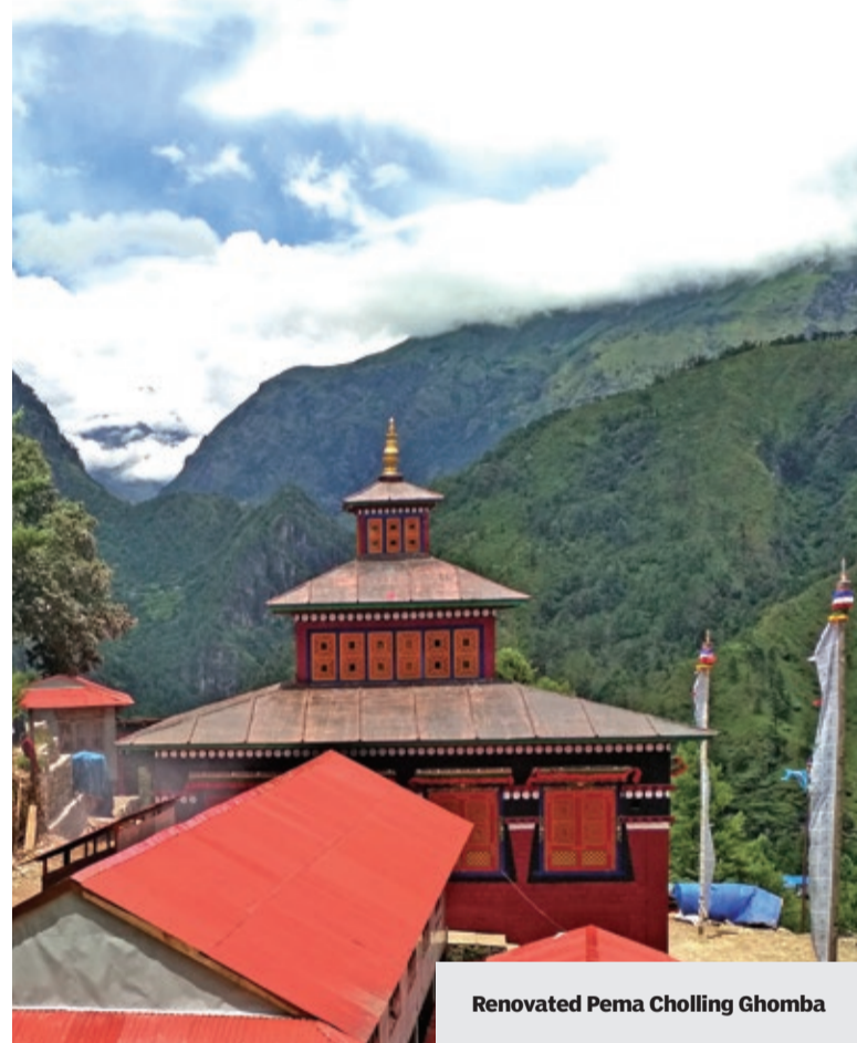
Renovated Pema Cholling Ghomba